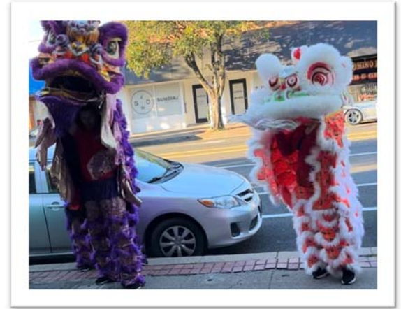
Dancers on Main Street kicked off the celebration